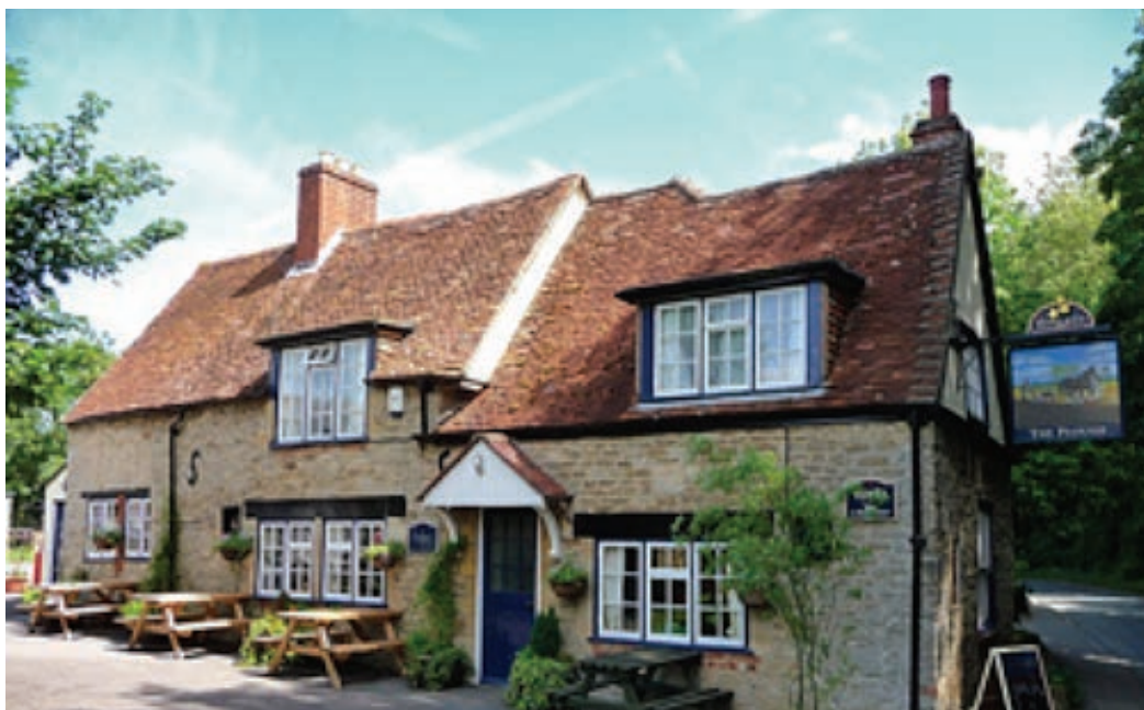
The Plough Inn, Eaton Road, Appleton

6.4.4 The gardens of both public houses are used as venues for events. The Plough Inn and The Eight Bells hold outdoor music events while The Plough Inn with its extensive garden hosts clubs and societies either for or after their meetings and for special events. The Eight Bells has an Aunt Sally team and the Plough Inn is busy rebuilding its team after a few years of neglect.