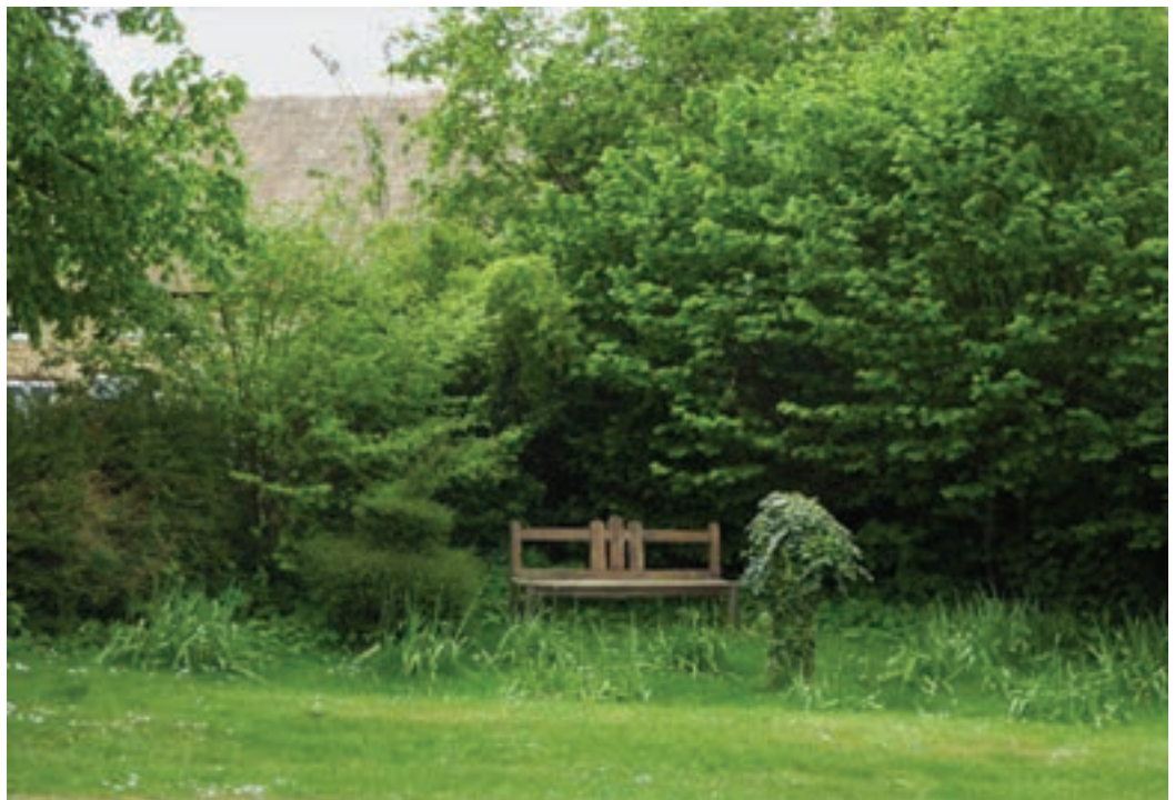
Remnant of the Great Green, Eaton Road, Appleton

6.2.1 The NPPF encourages local communities to identify for special protection green areas of particular importance to them. By designating land as Local Green Space, local communities will be able to rule out new development other than in very special circumstances. Ordnance Survey Open Green Spaces data shows that Appleton with Eaton has only 0.6% green coverage compared to an average of 1.7% for communities in Oxfordshire and 2.2% in England. However, the Parish sits within the Green Belt which offers the same protection as a designation as Local Green Space. Several of the Green Spaces identified in Appendix 2: Green Spaces Assessment are already protected by their Green Belt status.