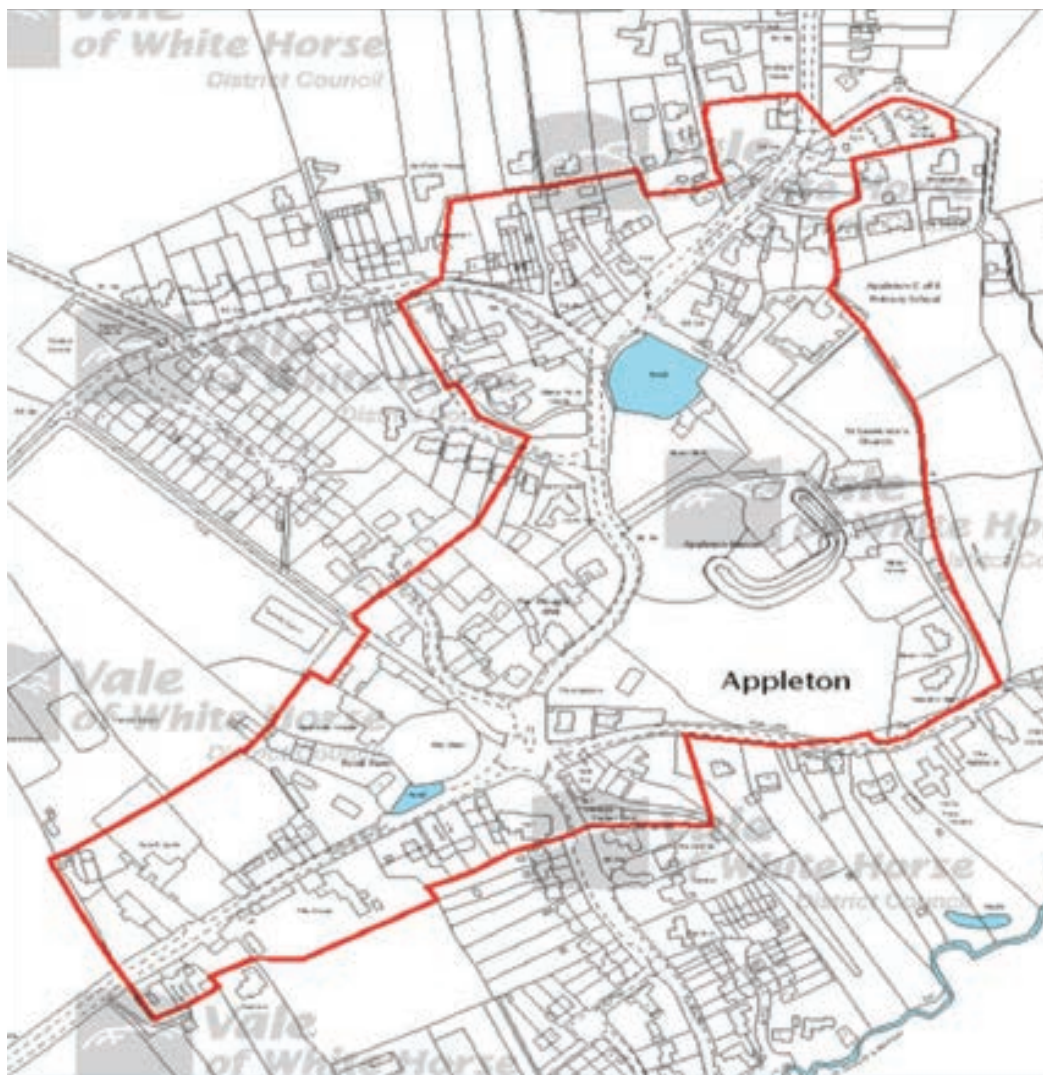
Map 3: Appleton Conservation Area

3 Vale of White Horse Local Plan Parts 1 and 2 2031 Core Policy 39