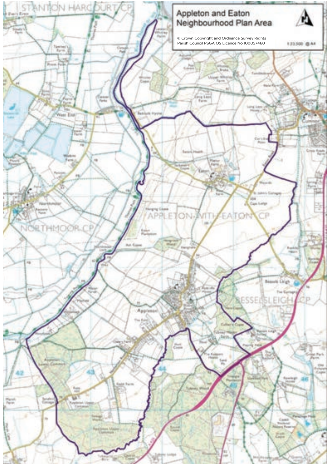
Map 1: Appleton with Eaton Neighbourhood Plan Area