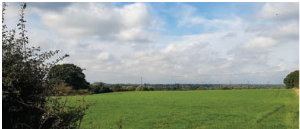
View from Green Lane, Appleton to the River Thames valley

6.6.3 New development should protect and exploit opportunities for the use of sustainable transport such as walking and cycling. Appendix 4: Community Connectivity Assessment highlights several routes in need of improvement. Development proposals should consider the needs of the village as set out in the Connectivity Assessment and seek to maximise the opportunities identified there. Policy 7 has been designed to have regard to the Community Infrastructure Levy Regulations. In particular Regulation 122 requires that any developer contributions should be necessary to make the development acceptable in planning terms; directly related to the development; and fairly and reasonably related in scale and kind to the development. The Parish Council will have the ability to use its local element of Community Infrastructure Levy funding towards the costs of the projects listed in Appendix 4 of the Plan as it sees fit.