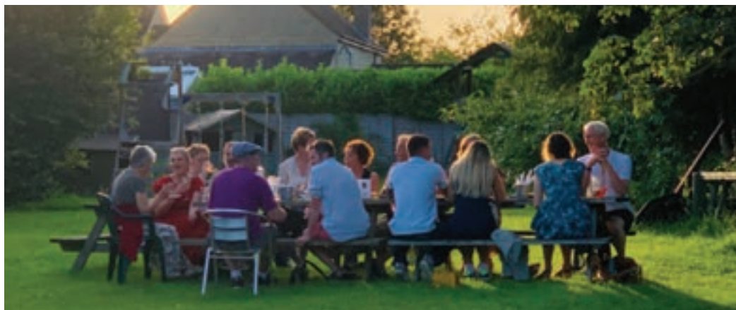
The garden at The Plough Inn, Eaton Road, Appleton

Conforms with Vale of White Horse Local Plan 2031 Part 2 Development Policies 8 (Community Services & Facilities) and 9 (Public Houses).