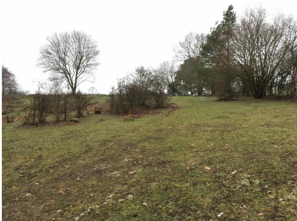
Plate 14 Trees lining the northern site boundary within the acid grassland