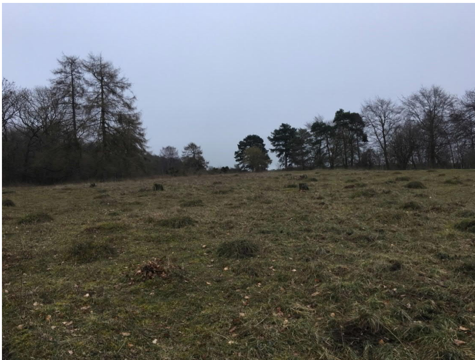
Plate 6 Calcareous grassland situated on the southern valley slope