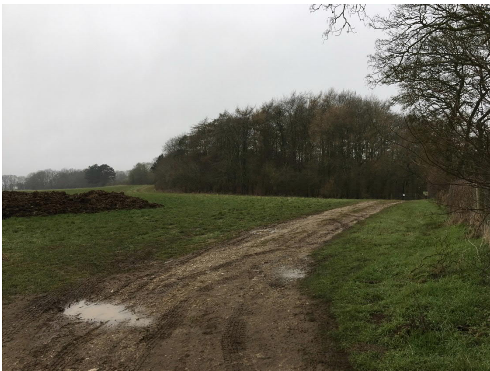
Plate 16 Bridleway leading to the BBOWT Nature Reserve from Beckley

During the AECOM site visit, a single dog walker with two dogs was observed leaving the Nature Reserve; both dogs were observed to be off their leads. Two additional dog walkers were observed walking along the Public Right of Way which connects to the Nature Reserve entrance; although these dogs were kept on a lead, it was not clear whether these people had entered the SSSI.