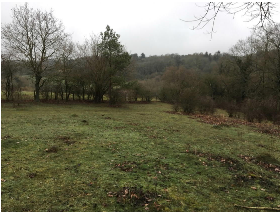
Plate 4 Acid grassland present on the northern valley slope