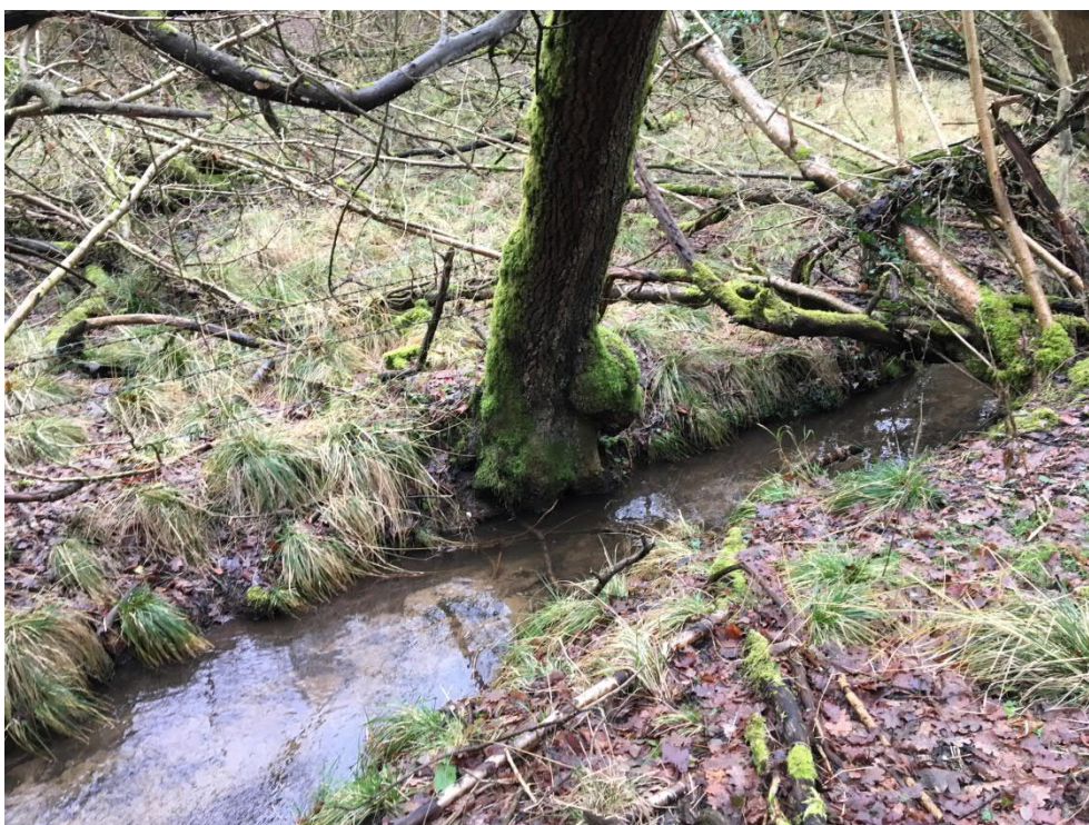
Plate 13 Stream present within woodland