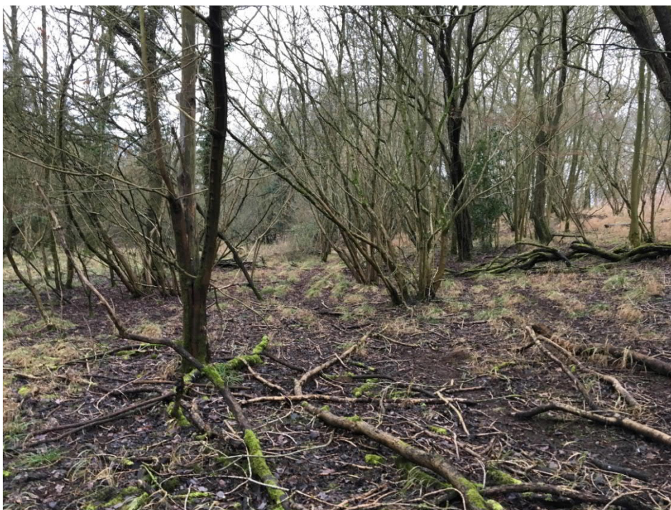
Plate 2 Broadleaved woodland with sedges and common reed on woodland floor