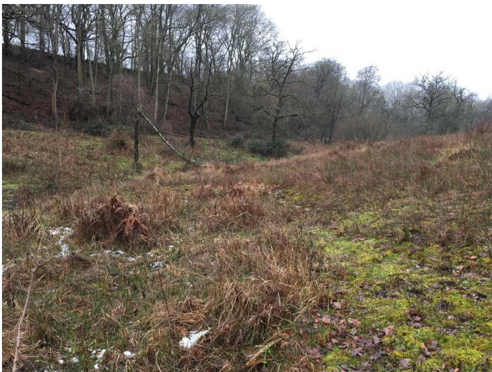
Plate 9 Fenland located at the base of the valley