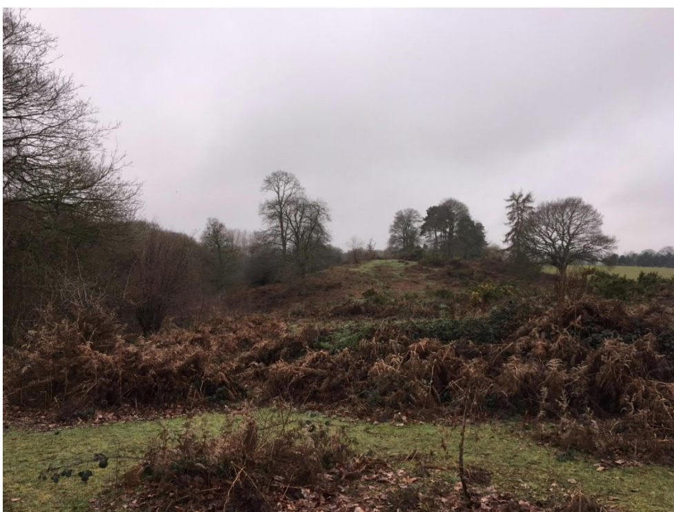
Plate 5 Bracken, bramble and gorse coverage on the dry heath and acid grassland