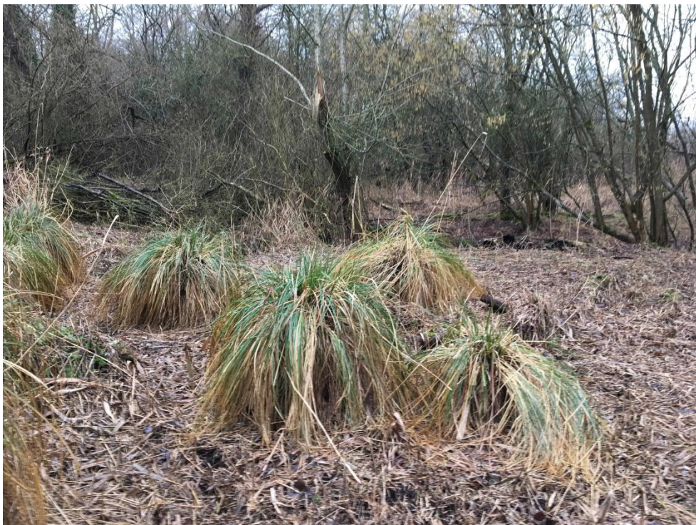
Plate 10 Cut reed bed with greater tussock sedge at the Site's north-eastern boundary

Small patches found within the woodland at its most western extent. In addition, three open patches of reed bed were found adjacent to areas of wet woodland and within the site's north-eastern corner adjacent to the stream (Plate 11; TN7). All areas were characterised by dominant common reed. Greater tussock sedges ( Carex paniculata ) were recorded within the north-eastern patch (Plate 10).