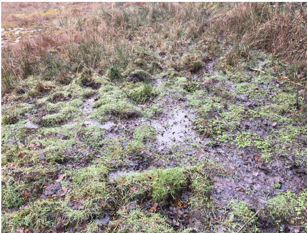
Plate 8 Fen predominantly comprised of bryophytes, sedges and rushes.

An area of fen extends transitions from wet woodland near the Site's eastern perimeter into an open clearing, surrounding the central stream situated within the base of the Site's vale (Plate 8). The open clearing comprises inundated fen habitat with an abundance of sedges ( Carex spp.), bog pimpernel ( Anagallis tenella ), rushes ( Juncus spp.) and bryophytes.