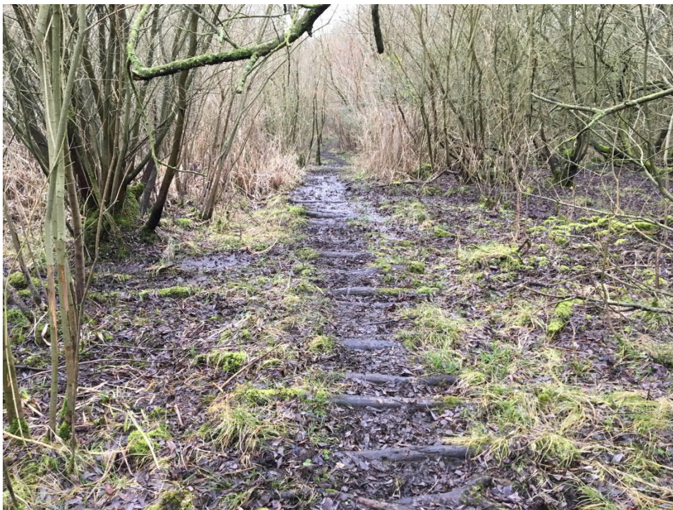
Plate 15 Permissive path that traverses the College Pond end of the SSSI