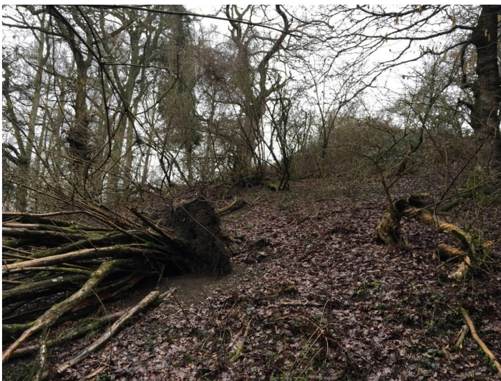
Plate 3 Dry broadleaved woodland present on the valley's steep slope