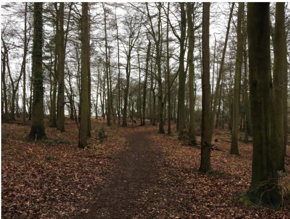
Plate 7 Predominant beech plantation woodland

Mature broadleaved plantation woodland was identified within the Site's south-eastern corner adjacent to the Nature Reserve's entrance (Plate 7). Species recorded included beech, hazel, dogwood, elder, hawthorn and larch ( Larix decidua ).