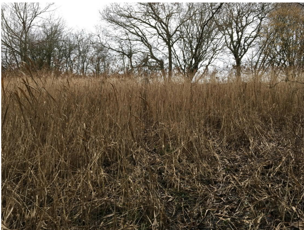
Plate 11 Reed bed situated along the Site's perimeter within the College Pond section (TN7)