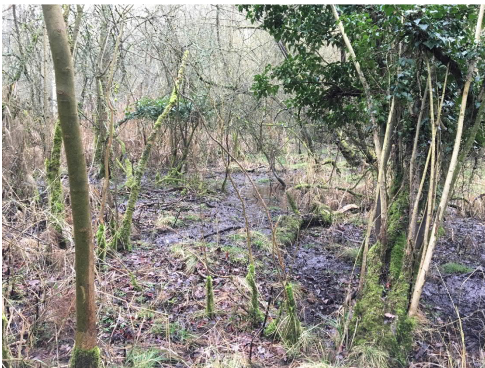
Plate 1 Dense, wet woodland characteristic of areas adjacent to streams

Where woodland transitioned from wet to dry, and in some cases into areas of fen or dense reed, sedges ( Carex sp.), tufted hair grass, common reed and great horsetail were frequently found upon the woodland floor. Furthermore, several fungal species, including Scarlet elf cup ( Sarcocosypha coccinea ), were numerous observed across the woodland.