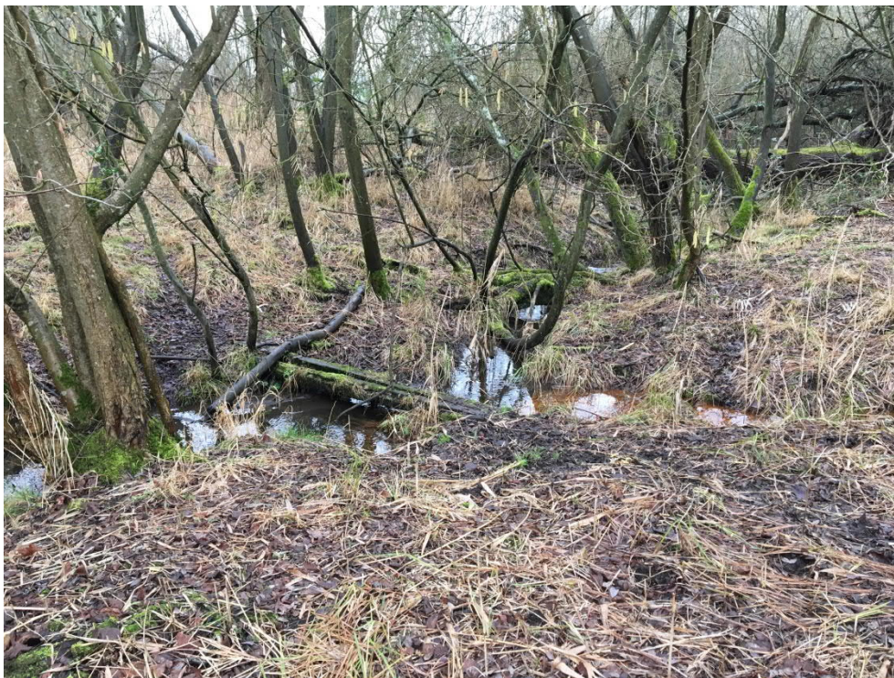
Plate 12 Stream acting as a boundary between woodland and swamp habitat

Several sources of water traverse the site and join a central stream that flows the length of the SSSI from east to west. The central stream initially enters the Site at the northeast boundary, acting as a barrier between carr and an extensive reed bed (Plate 12). This stream subsequently flows through the centre of the valley, traversing fen and woodland further west.