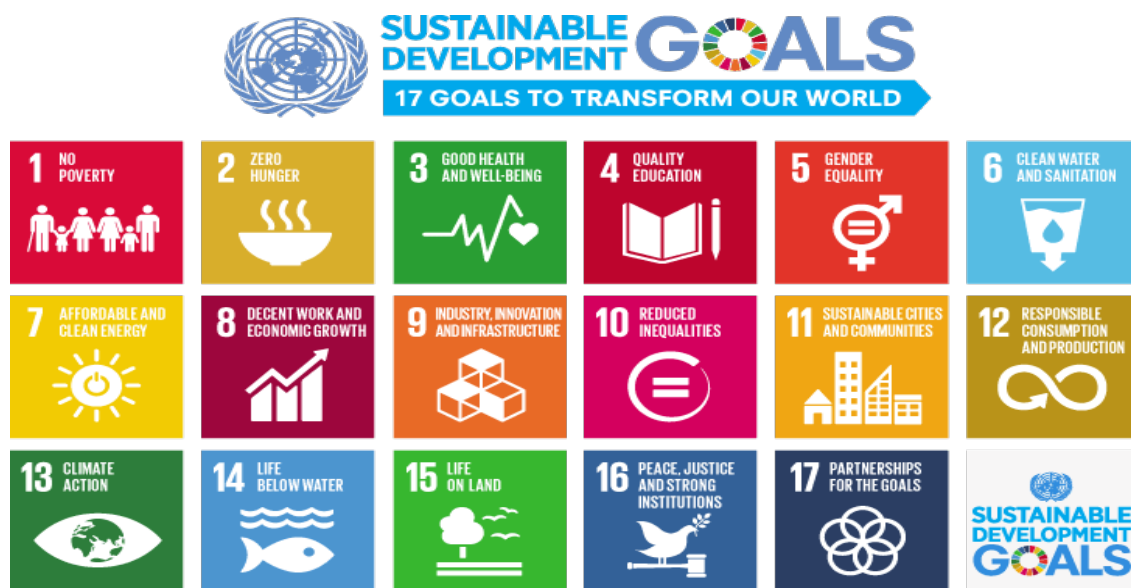
Figure 1: UN Sustainable Development Goals

2.3. These goals should therefore inform our understanding of sustainable development and how sustainable our settlements are.