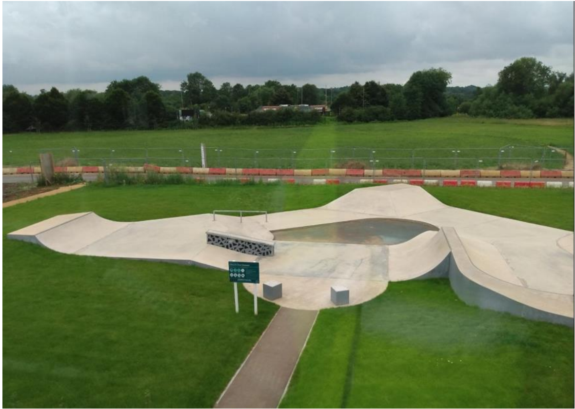
Skate park at Benson secured through a S106 agreement and delivered directly by the site developer.