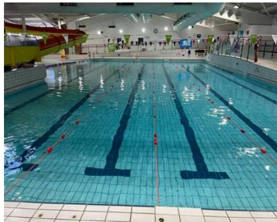
LED swimming pool lighting at Didcot Wave funded by £19,835 of S106 contributions installed in November 2023.