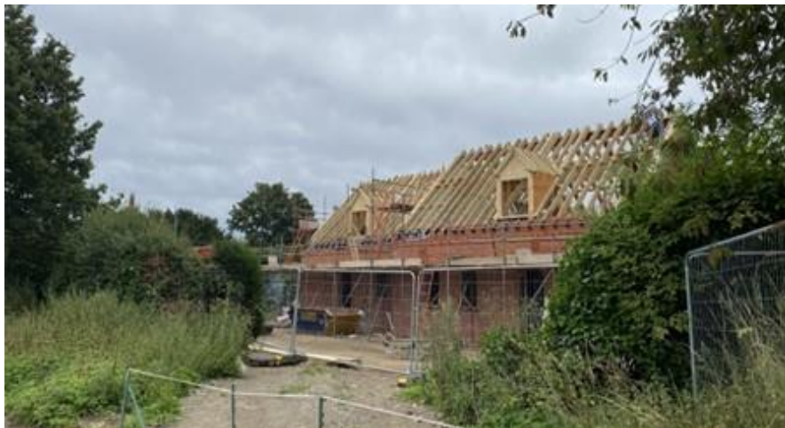
Image of the construction stage of affordable housing development by the Henley and District Housing trust.

Financial contributions were allocated to The Henley and District Housing Trust to help deliver two separate affordable housing projects. The first of which was the development of two new semi-detached, two-bedroom dwellings which has been completed. The second project, currently awaiting commencement, is the development of a two-storey side extension to facilitate a sub-division of a semi-detached two-storey house to provide a ground floor one bedroom flat and a first floor one bedroom flat.