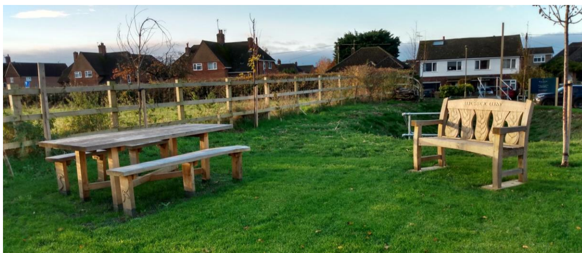
Public art S106 funded picnic table and benches at Long Wittenham, installed in August 2023

Town and parish councils that have received CIL funding must report what they have spent the money on to the council on an annual basis. The town and parish council expenditure reports are on our website .